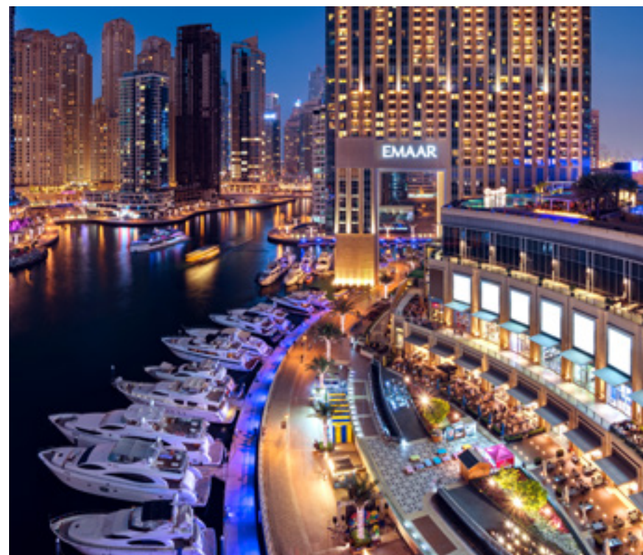
150,000 Sqm Marina Mall