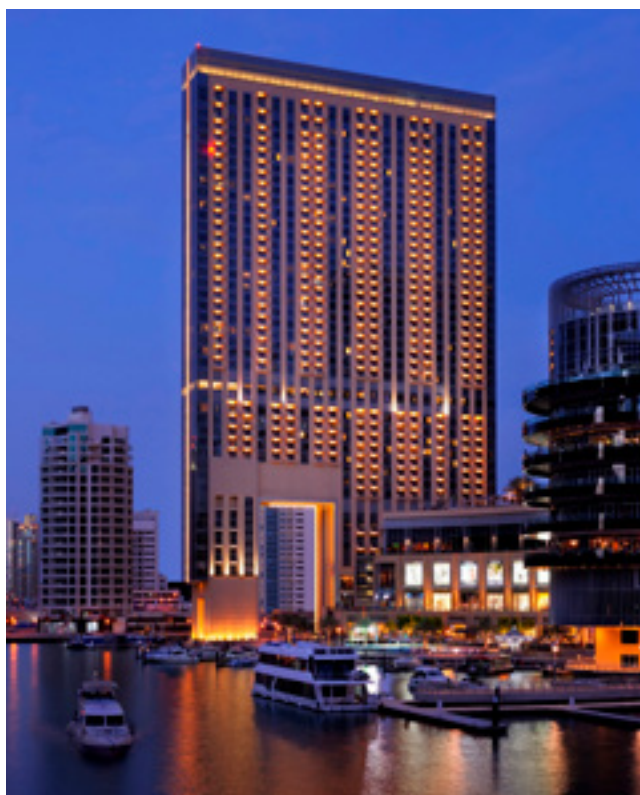
5-star Premium Hotel, The Address Dubai Marina

Famous for its vibrant nightlife, exceptional dining venues and an abundance of activities that will satiate your every desire.